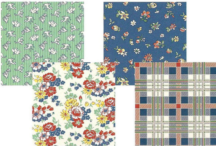
Fall Frolic range

Quilting and fabric design, however, remain her number one interest, and have done ever since she made her first quilt, a log cabin design, and designed the ‘Callie lu Sunflower’